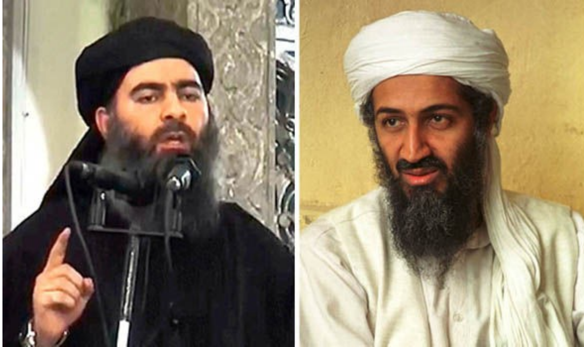
Abu Bakr al-Baghdadi (left, former leader of ISIS), and Osama bin Laden (right, former leader of al Qaeda), primary targets of the American “War on Terror”