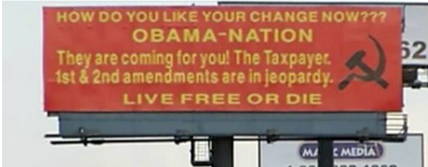
Billboard in Blue Ridge, Missouri, on the side of Interstate 70