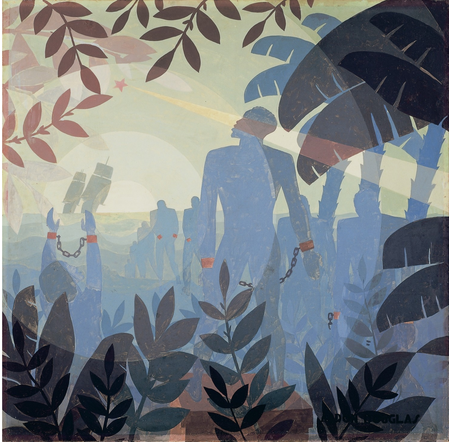
“Into Bondage” Aaron Douglas (1936)