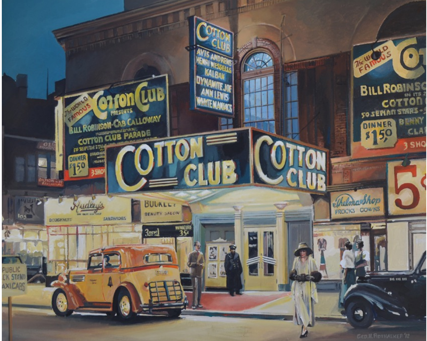
“The Cotton Club”, Harlem’s biggest jazz nightclub 1923-1940