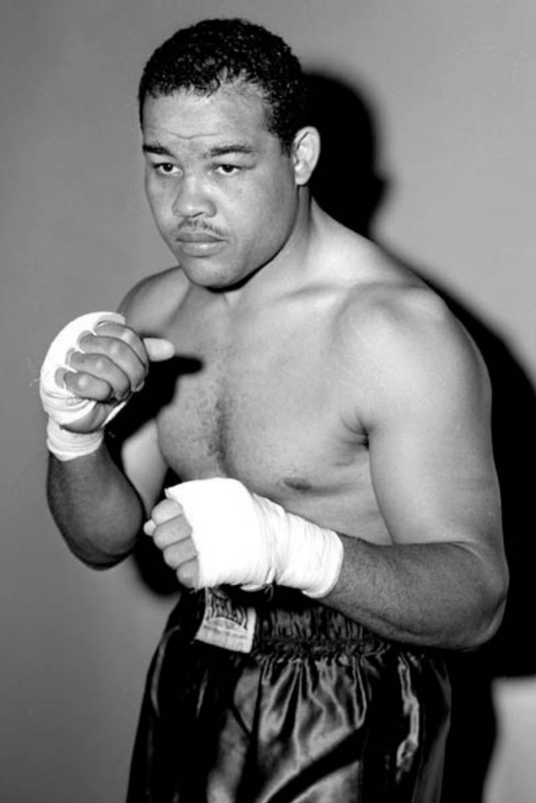
Joe Louis ( Boxing Heavyweight World Champion 1937-1949 )